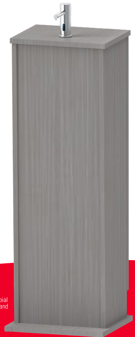
FS-0700 Antimicrobial Plastic Laminate Stand