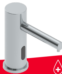
0390-HSD High Capacity Hand Sanitizer Dispenser

* Dispenser is installed on site using pre-drilled holes