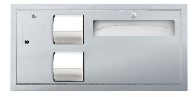
Shown above: 0487-R; below: 0487-L